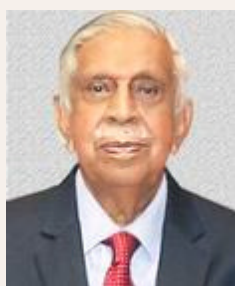
Mr. Justice M. N. Venkatachaliah

IIAM is guided by an Advisory Board, comprising of eminent, credible and distinguished professionals having rendered outstanding service in the field of law and ADR. They guide the Institution on procedural and ethical aspects concerning ADR. IIAM, being APCAM India, it is also guided by an Advisory Board, comprising of the most experienced and credible names from diverse jurisdictions around the globe. The Advisory Board includes former Chief Justices or Judges of the highest court of the country, reputed Academics or Senior Lawyers actively involved in the field of arbitration, mediation or other ADR options, or distinguished professionals having rendered outstanding service in the field of ADR