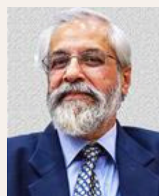
Mr. Justice Madan B. Lokur

Former Chief Justice of India & Former Chairman of the National Human Rights Commission