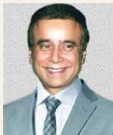
Dr. Madhav Mehra

Former Judge, Supreme Court of India and Judge Supreme Court of Fiji